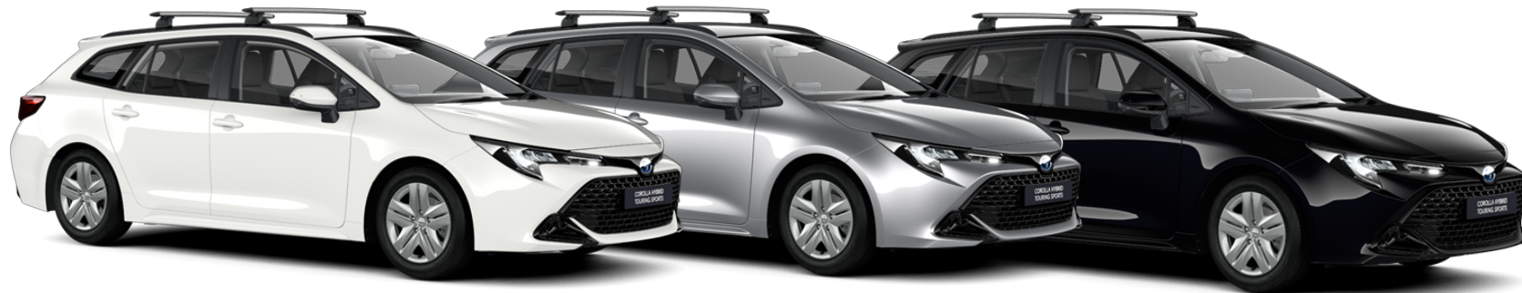
Pure White (040)