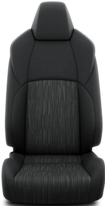
Black Fabric with Grey Stitching

Black fabric with grey stitching is now available with a unified black instrument panel that delivers a fresh image.